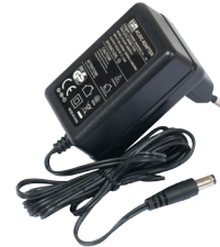
24V 0.8A Power adapter