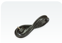
2x power cord